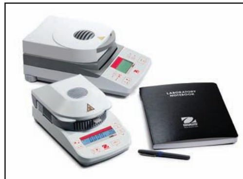
With its small footprint, the OHAUS MB23 and MB25 are compact enough to fit on any benchtop