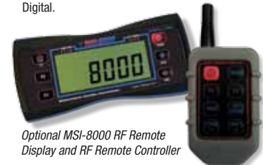
Optional MSI-8000 RF Remote Display and RF Remote Controller