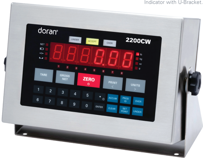
Indicator with U-Bracket.

Prompts and process control for measuring ingredients and ensuring user-defined tolerances are met for each ingredient every time. An auto learning setpoint feature compensates for changing process inputs and the system can interface with existing load cells. The 2200CW provides precision measurements from .01g to 100,000 pounds