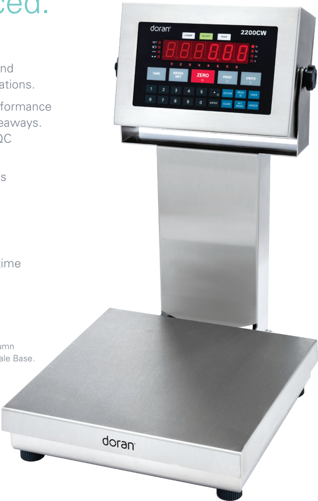
Indicator with 14" Column and DXL Series SS Scale Base.

The 2200CW SS Series is designed for speed, durability, and versatility — a smart choice for a range of weighing applications. Fast and accurate checkweighing to boost bottom line performance — by improving accuracy and decreasing shortages or giveaways. Add Doran QC Weigh software to automate and validate QC procedures, and improve production staff accountability. The system features a responsive keypad, rugged stainless steel construction, and IP69K classification for washdown protection — with components that are built in the USA. A large selection of Doran power options, scanners, and communications and networking equipment, and other accessories. Plus, add Doran ionSuite™ software for real-time data collection and efficient production.